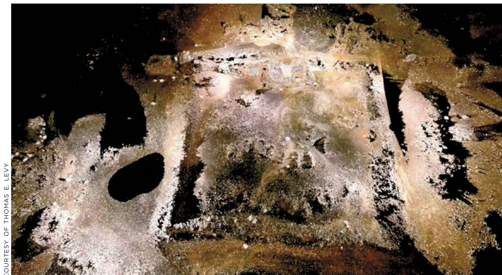
LiDAR scan of the Iron Age fortress at Khirbat en-Nahas, Jordan.

Helium balloons and drones (UAVs), are another important set of data capture tools used by archaeologists for photography, mapping and 3D model building of archaeological sites. A helium balloon system has proved most useful for us. The balloon (Kingfisher™ Aerostat) is tethered to an operator on the ground who can position it over an excavation area and cover up to 2,153 square feet. A stable aluminum platform was designed to hold two 15-megapixel digital single lens reflex cameras for stereo photography monitored with